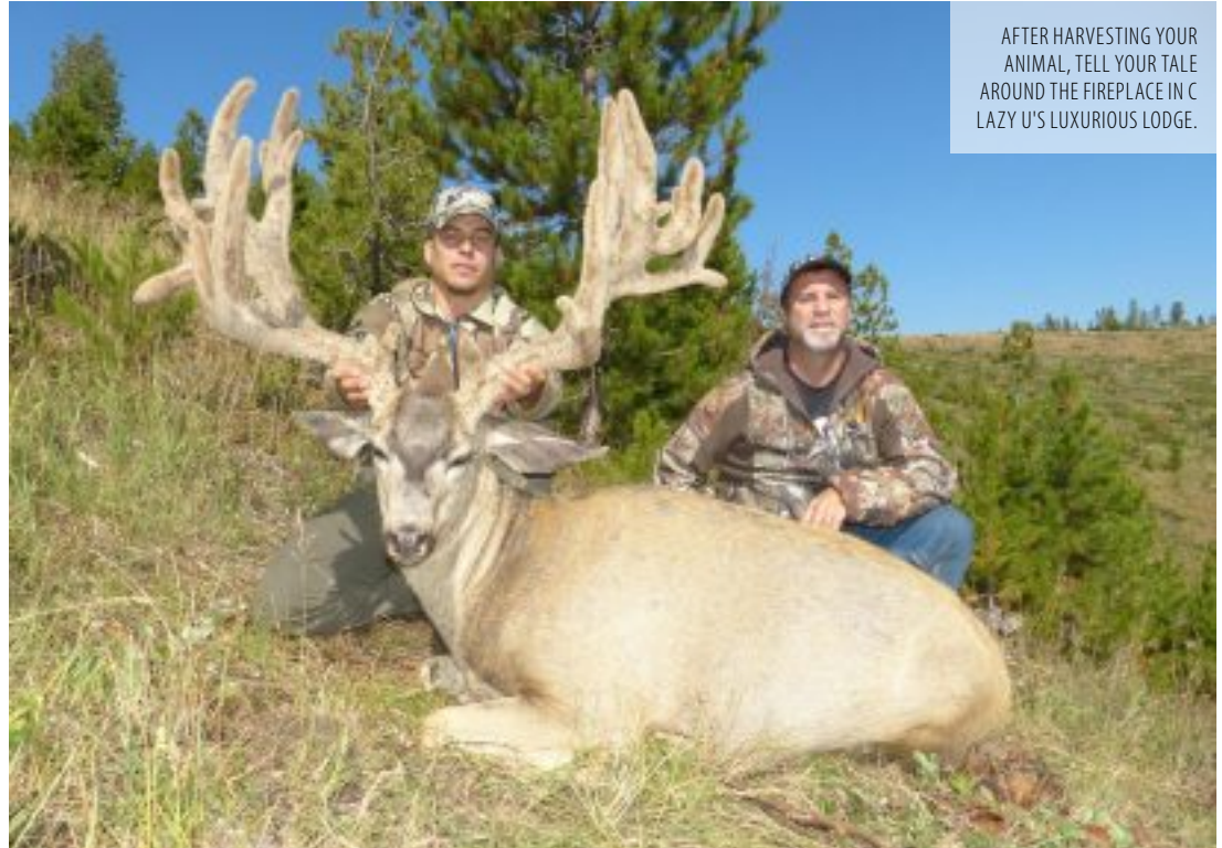
AFTER HARVESTING YOUR ANIMAL, TELL YOUR TALE AROUND THE FIREPLACE IN C LAZY U’S LUXURIOUS LODGE.

“TROPHY HUNTING MAKES UP A BIG PART OF C LAZY U’S OUTFITTING BUSINESS, ESPECIALLY EARLY SEASON.”